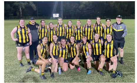
The Tigers winning team last night at the Den over the Redcliffe Tigers.

back with two goals of their own to come within a point at the final break.